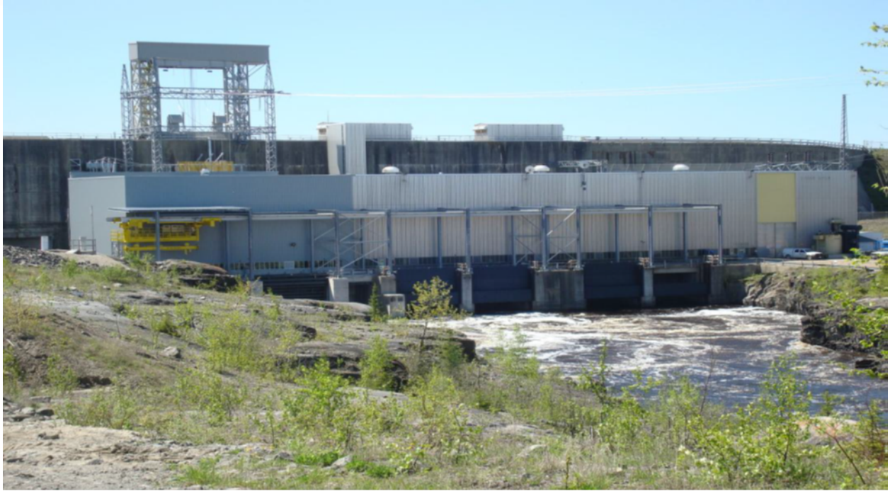
Little Long GS June 2014