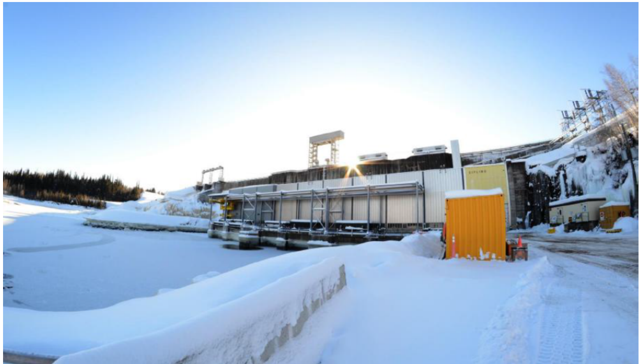
Kipling GS January 2015