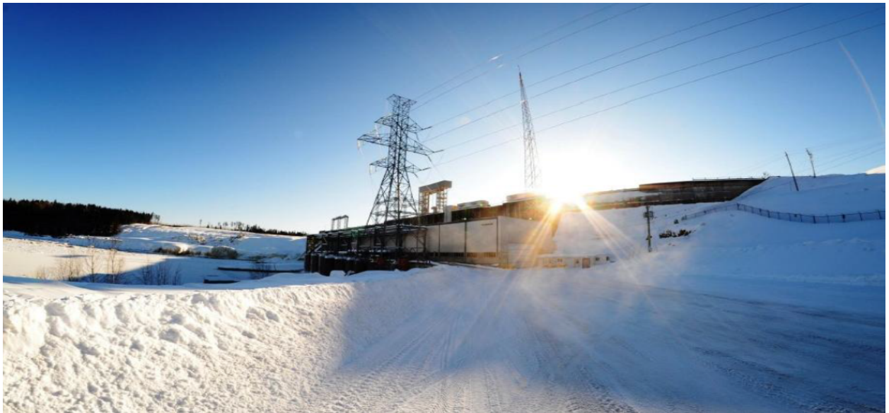
Harmon GS January 2015