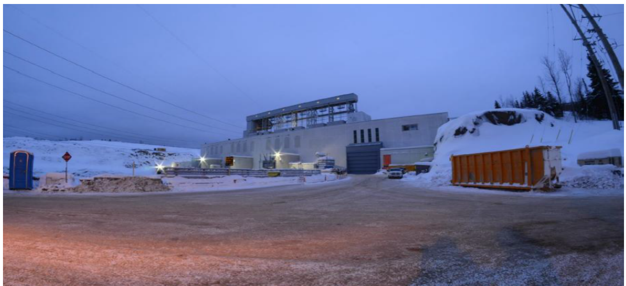
Smokey Falls GS January 2015